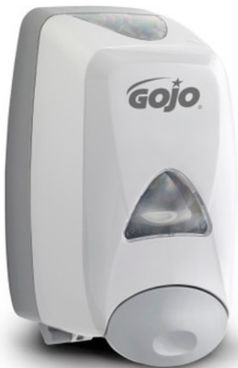
Gojo FMX-12 Dispenser Push-style dispenser for Gojo Foam Soap Available in White and Black