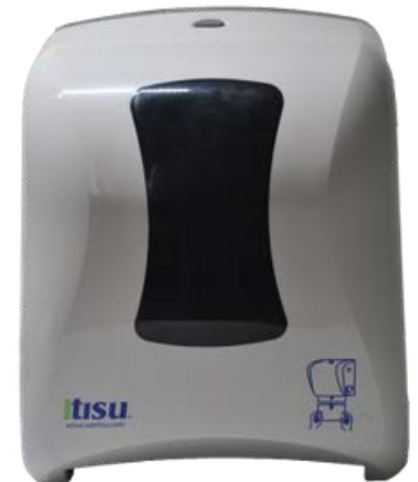
JRHT Dispenser Auto-Cut (Manual)