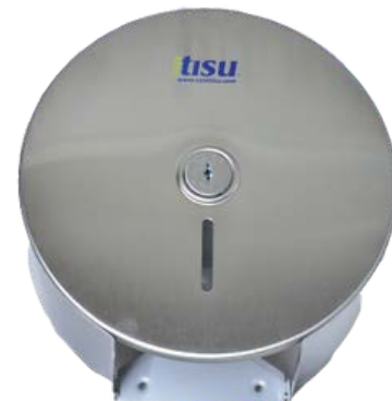
9" JBT Dispenser (Stainless Steel)