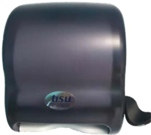
JRHT Dispenser Auto-Cut (Manual with Lever)

(All dispensers are available in White and Transparent Smoke)