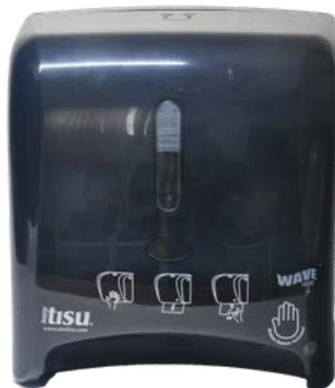
JRHT Dispenser Auto-Cut (Sensor)