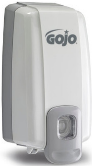
Gojo NXT Space Saver Dispenser Push-style dispenser for Gojo Lotion Soap Available in White and Black