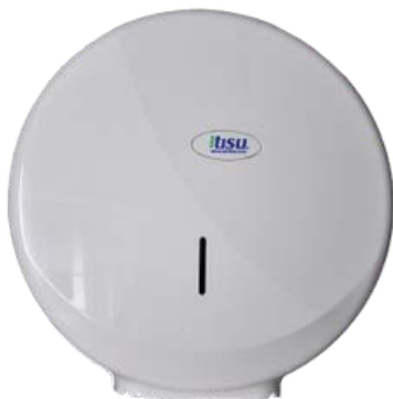
9" JBT Dispenser (White)