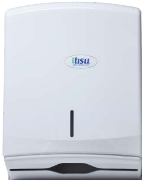
Interfold Dispenser (Available in White and Transparent Smoke)